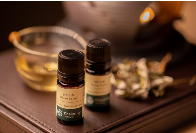
Our Original Essential Oil "Serene Forest"

Enjoy a blissful experience in the slow and quiet passage of time.